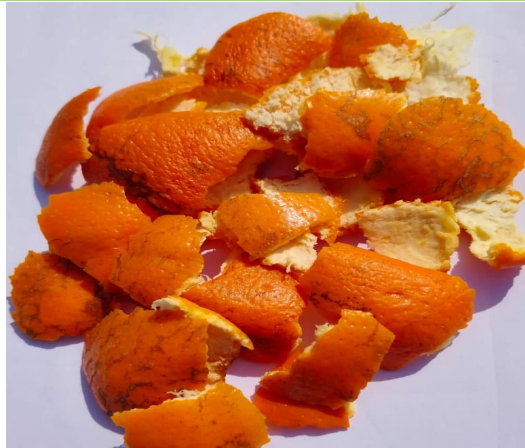
Figure 2. Dry orange peel