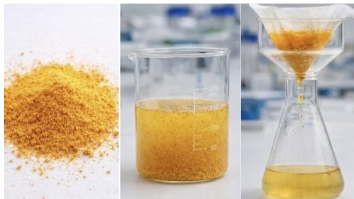
Figure 3. Preparation of extract of orange peel

After the maceration period, the extract was filtered through filter paper using a funnel to separate the solid peel residues. The resulting filtrate was a concentrated orange peel extract rich in vitamin C, essential oils, and other antioxidant compounds, which was then used for serum formulation (Figure 3).