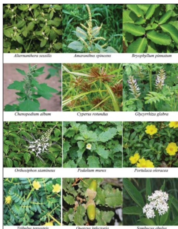
Figure 3: Herbal Medicines

Some herbs have been reported to possess significant levels of hepatoprotection due to the bioactive compounds contained in them [8]. They work through several pathways that include actions to combat oxidative stress, inflammation, viruses, and detoxification. In this section, the specific functions of these herbs and the ways in which they contribute to liver health are discussed in further detail [9].