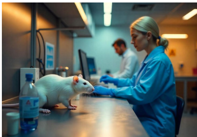
Figure 3: Animal Pharmacological 20

Pharmacological validation using animals is critical in substantiating bio-relevance of biological findings in pharmacognosics and analytics. The relevance of standardized formulations in relation to their physiological and therapeutic value can thus be evaluated successfully through controlled studies in vivo. An example is the observation that polyherbal preparations consisting of antioxidants such as Terminalia chebula (Haritaki) Curcuma longa (Turmeric) and Camellia sinensis (Green tea) have a significant dose-dependent enhancement of endogenous antioxidant enzyme levels; superoxide dismutase (SOD), catalase, and glutathione peroxidase, in rat liver homogenates. These beneficial changes in biochemicals indicate that the standardized occurrence of phenolic and flavonoid compounds is directly correlated with the antioxidant activity 19 .