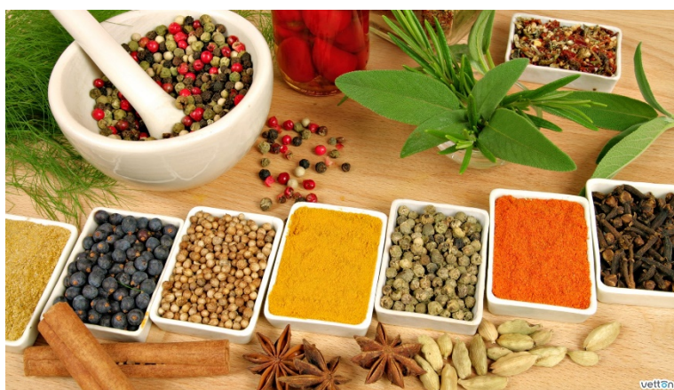
Figure 1: Polyherbal Formulations 2

pharmacological efficacy, are especially conspicuous considering their synergistic pharmacological effects and fewer side effects than the case of single-plant preparations. Nevertheless, even though such formulations have potential in therapy, their reliability and reproducibility are largely determined by standardization. The insensitivity of bioactive profiles due to the variation in the source of plant materials, environmental factors, and the methods used can cause serious safety and efficacy problems. It is therefore necessary to put in mind a comprehensive pharmacognostic and quality management frame to warrant the uniformity, identity, purity and potency of polyherbal formulations before they could be used in experimental and therapeutic conditions.